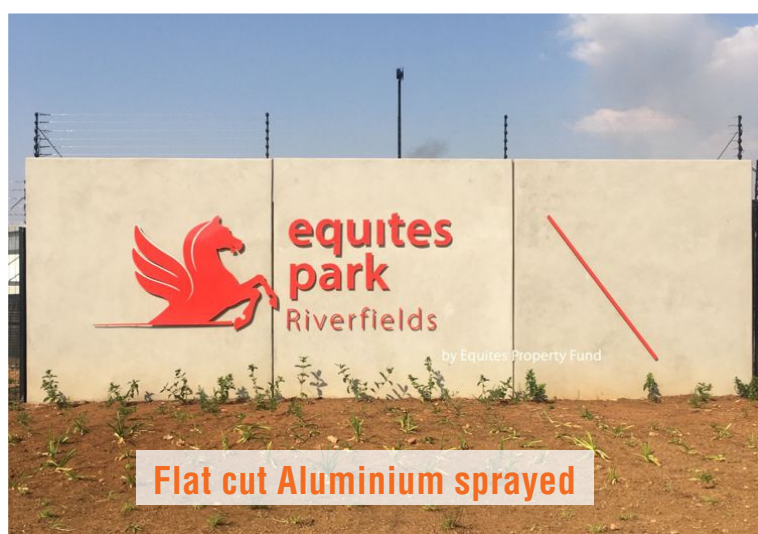
Flat cut Aluminium sprayed