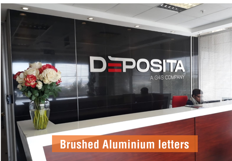
Brushed Aluminium letters