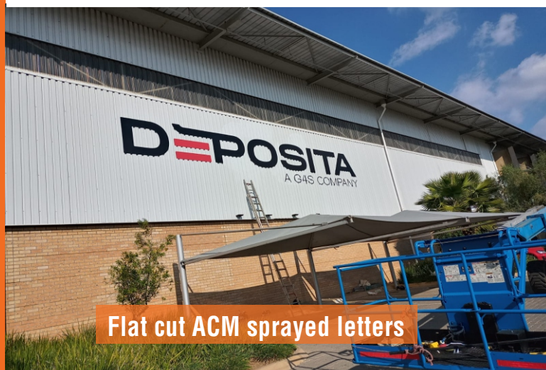
Flat cut ACM sprayed letters