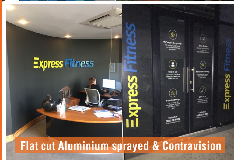
Flat cut Aluminium sprayed & Contravision