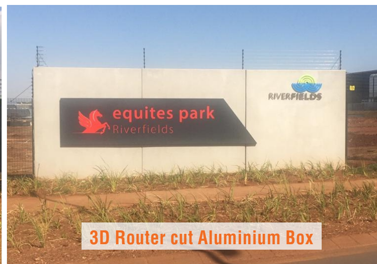
3D Router cut Aluminium Box