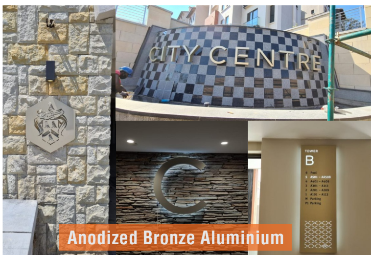
Anodized Bronze Aluminium