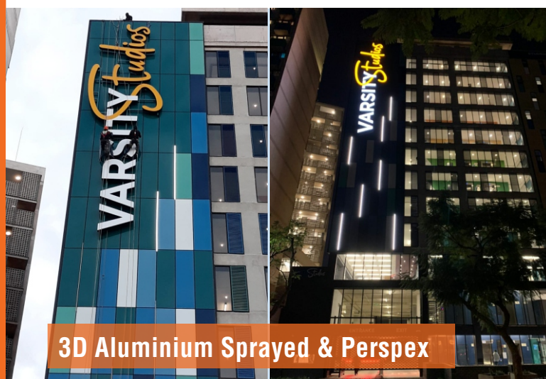
3D Aluminium Sprayed & Perspex