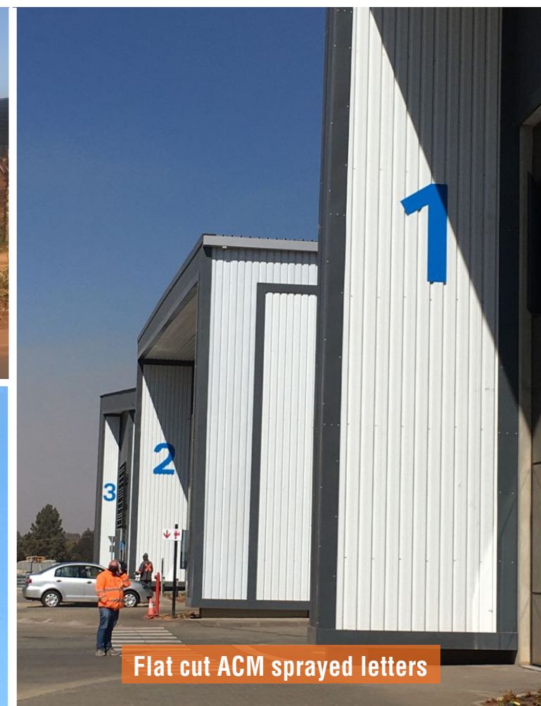
Flat cut ACM sprayed letters