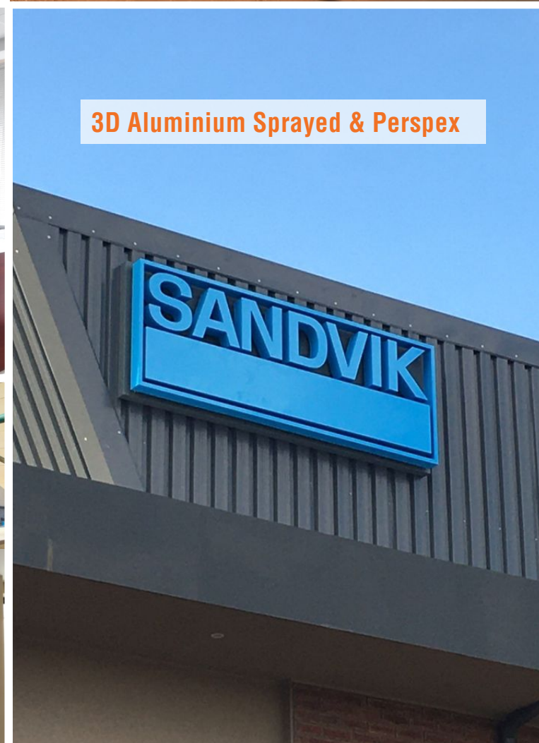
3D Aluminium Sprayed & Perspex