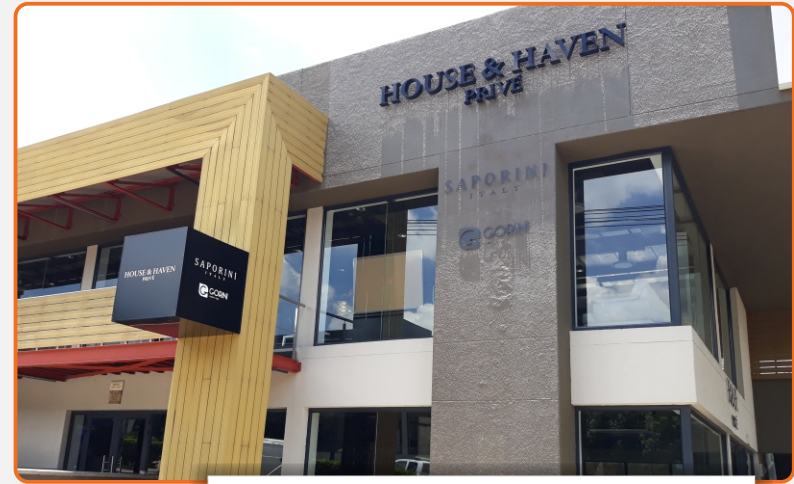
House & Haven: 3D Box & Sprayed Aluminium letters